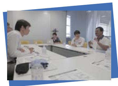
(Some stills from the film The Pad Piper )