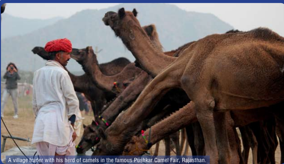
A village trader with his herd of camels in the famous Pushkar Camel Fair, Rajasthan.