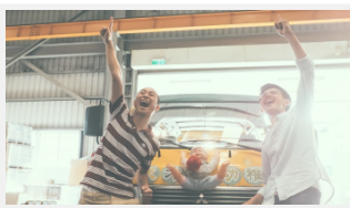
25 Films you cannot miss at the Taipei Film Festival 2016 In "Film Festival"