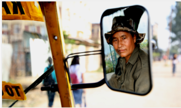
Auto Driver by Meena Longjam – Imphal

Laibi is a lady auto driver based in conflict torn Imphal city. In order to support an ailing husband and education of her two sons, she took up this profession defying a traditional Society. Starting off as a daily wage labor in a brick farm where she earn only 60 rupees for loading 1500 bricks, she now has to face the discrimination of passengers who shun lady auto drivers.