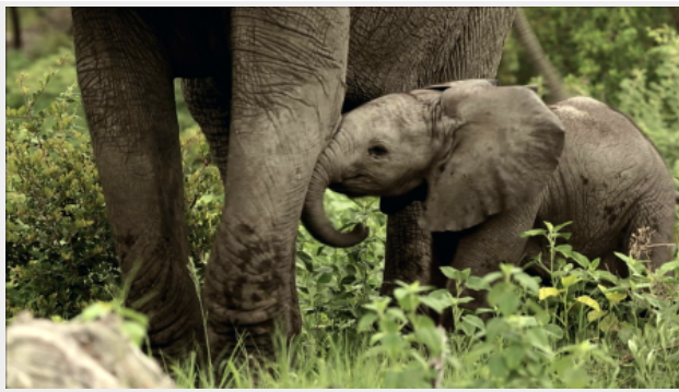
Soul of the elephant by Beverly Joubert, Dereck Joubert – Australia | 2015 – 39 min.

Ironically, every dead elephant with its ivory intact is a reason to celebrate. It means an elephant died of natural causes, not bullets, snares or poison, and a soul was allowed to be celebrated and mourned by its herd. Award-winning filmmakers, Dereck and Beverly Joubert start with the remains of two bull elephants and through a series of key flashbacks, look at the lives they would have led, the dramas they may have seen, their great migrations for water with their families, and their encounters with lions and hyenas. This film, shot over two years, is an intimate look at elephants through the lens of perhaps the greatest storytellers of natural history.