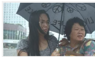
Winners of the Freedom Film Fest 2016 In "Film Festival"

TAGS: INDIA, NEW DELHI, WOODPECKER INTERNATIONAL FILM FESTIVAL