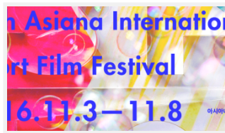
Winners of the Asiana International Short Film Festival 2016 In "News"